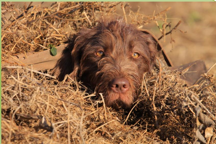
Vashti the Griffon on a Berthold ND, waterfowl hunt in late October

The next meetings are scheduled for Tuesday, February 15th, 2011 and Tuesday, March 15 th .